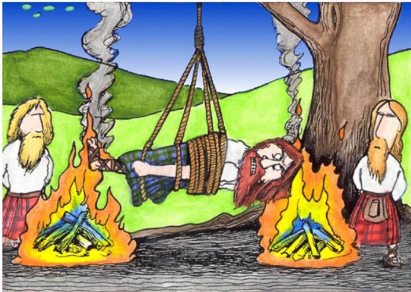
Early Scottish torture techniques, No.17: "Burning the Campbell at Both Ends."