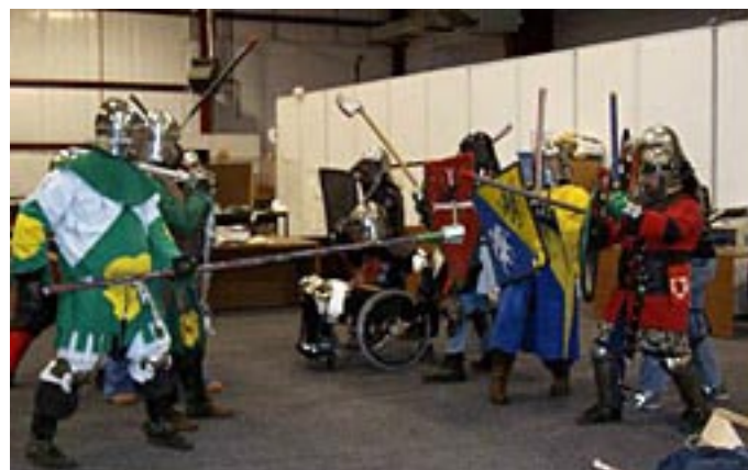
Fight practice at the CTTC - Melee!